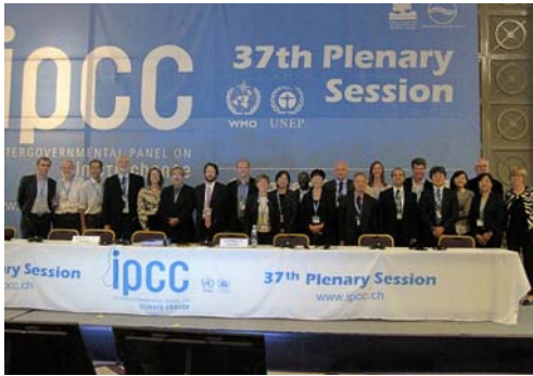
Adoption/acceptance of the KP Supplement at the 37 th Session of IPCC, 14-18 October 2013 in Batumi, Georgia