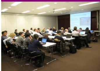
Third Lead Author Meeting in Oslo, Norway

Technical Support Unit IPCC Task Force on National Greenhouse Gas Inventories c/o Institute for Global Environmental Strategies 2108-11, Kamiyamaguchi, Hayama, Kanagawa, 240-0115, Japan Phone: +81-46-855-3750 Fax: +81-46-855-3808 E-mail: nggip-tsu@iges.or.jp www.ipcc-nggip.iges.or.jp